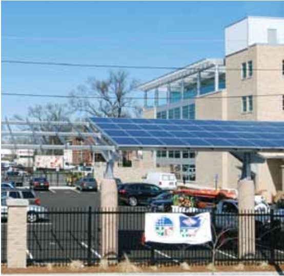
> Solar Panels partially installed at state building